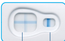
Result window Control window