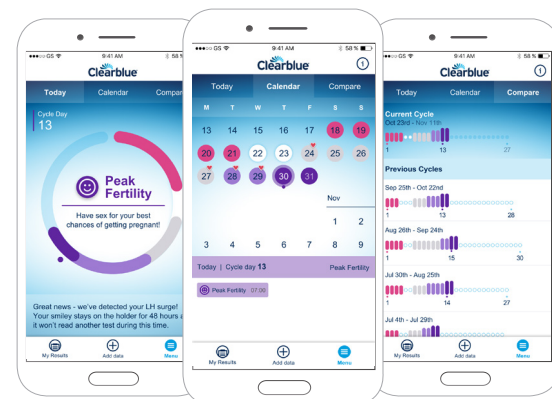
Figure 1: Clearblue™ Connected Ovulation Test System provides test results directly to a mobile App. A calendar enables viewing of daily information, and a cycle comparison screen enables easy viewing of fertility information in previous cycles.

The product has a connectivity function, via Bluetooth® Low Energy. Test results are uploaded directly to a mobile App and are viewable via a cloud-based web-hosted user account. The App displays test result information and further information relating to the user's menstrual cycle, e.g. a cycle summary. The user has the ability to upload additional information to the App and user account, such as dates of menses and intercourse.